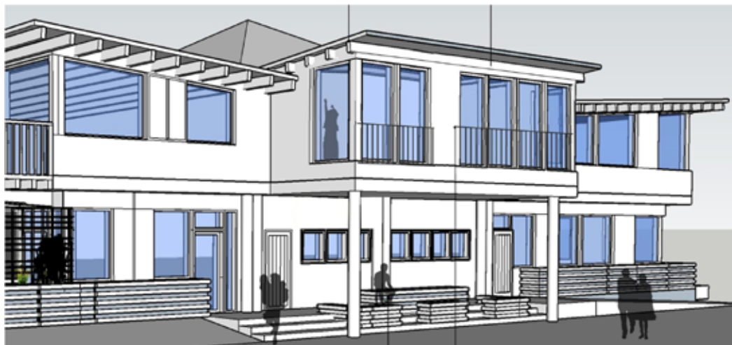
Impression of the new events space at Ouseburn Farm