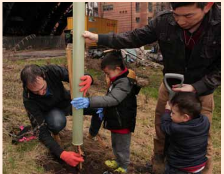
Volunteers help to plant new trees in Spring 2019.

If you are interested in applying for the post there are more details and an application form at www.ouseburntrust.org.uk/work-for-us