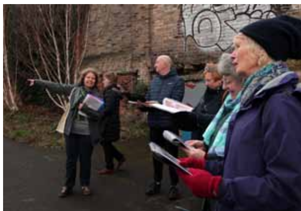
On the first tour.