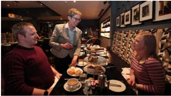
Afternoon Tea after a Tunnel Tour.

We're all going on an Ouseburn Bear Hunt... along the riverside... over the bridge... into the Tunnel, through snow and mud and forest... what will we find? These special visits in partnership with Seven Stories will run on Thursday 30 May, Sunday 23 June, and all Thursdays 25 July – 29 August. These multi-sensory adventures for families with young children can be booked at www.sevenstories.org.uk/whats-on