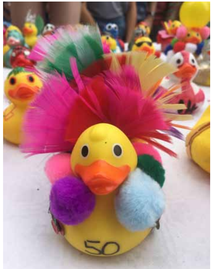
It's time to get your duck for The Cluny Duck Race!

Children (and adults) can join in the fun this year with a Farmers Club and festival workshops as well as The Cluny's infamous Duck Race which sees competitors decorate rubber ducks then launch them on the Ouseburn in a bid to win the coveted Golden Duck trophy (all ducks are retrieved from the river and returned to their creators).