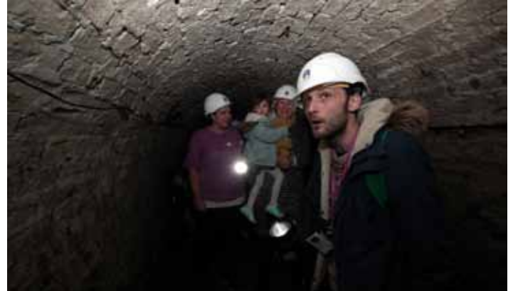
Families in search of bears!

If you've never seen a theremin before it's an electronic musical instrument controlled by the movement of the performer's hand near two high-frequency oscillators.