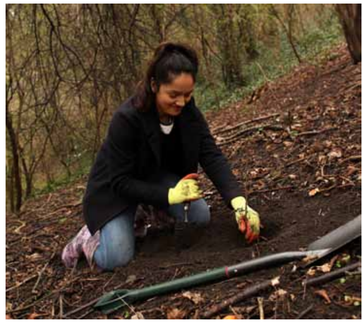
Volunteers in action planting trees in Ouseburn

Meet on the grass outside Ouseburn Farm. All tools will be provided. Please bring warm clothes and boots. The event will finish around 3pm but come for as long as you want. Just turn up on the day – or let us know you are coming and lunch will be provided. www.livingwoodsnortheast.org.uk