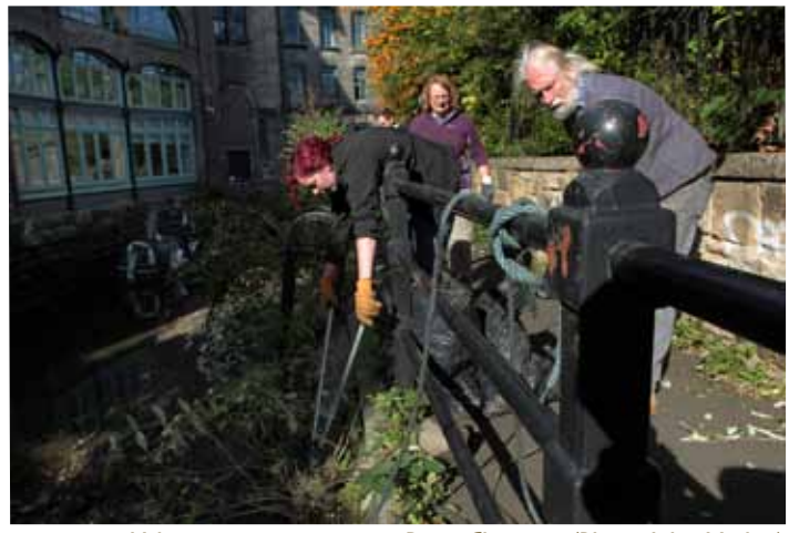
Volunteers in action on a River Clean up

Meanwhile our Clean Green team meet every Saturday morning at 10am behind The Ship Inn to spend a couple of hours looking after the paths, steps and environment in the Valley. You are welcome to come along for a couple of hours of fresh air and sociable activity – just wear old clothes and sturdy shoes or wellies.