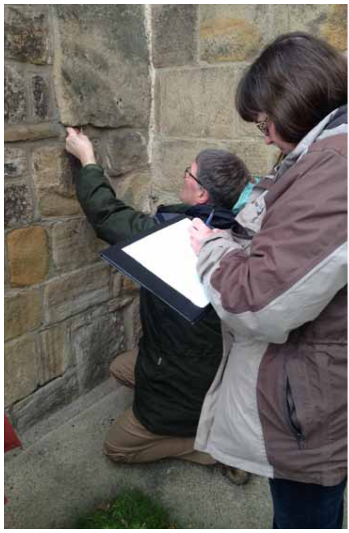
Volunteers will learn to identify re-used stones originally from the Wall

The second strand will include Where is our Wall? encouraging people to solve the mystery of the missing stones from Hadrian's Wall by training volunteers in identifying Roman Wall stones. Any readers interested in volunteering for the project,