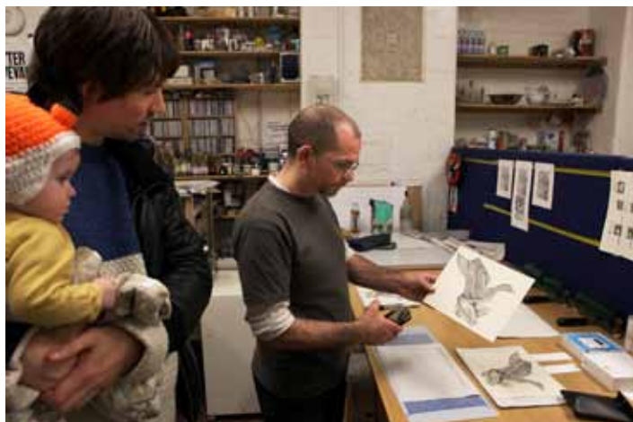
Hole Editions in 36 Lime Street during Open Studios 2017