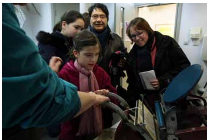
Having a go at Northern Print during Open Studios 2017

Plus a great variety of good quality Xmas stalls and a Xmas craft beer festival, great food, hot mulled Xmas drinks and hot chocolate drinks. The money raised on the charity stall goes to Brysons Animal Refuge in Gateshead.