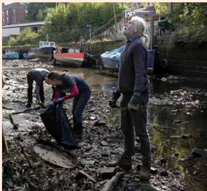
Volunteers in action on a River Clean up

We'll be exchanging news and views, celebrating achievements, and looking at priorities and proposals for how to move forward. We'll be thinking about how the environment should feature in the Ouseburn Regeneration Plan that is being revised in 2019. Residents, workers, businesses, visitors and students are all welcome to come along.