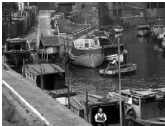
Still from 'Flowers for Peter'