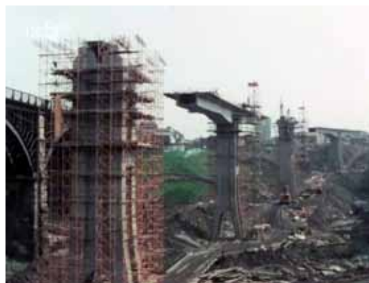
Still from 'Byker Viaduct'