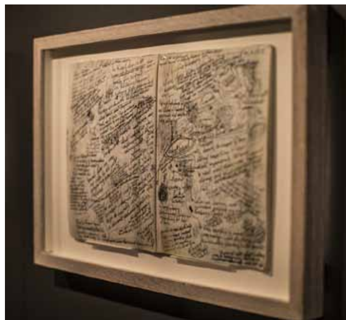
Explore the archives in Once upon a Tyne

Tickets are free but must be booked in advance at www.sevenstories.org.uk/whats-on